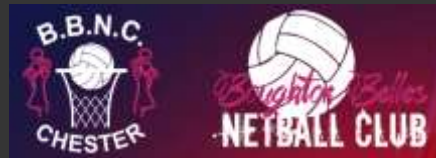
Boughton Belles NC