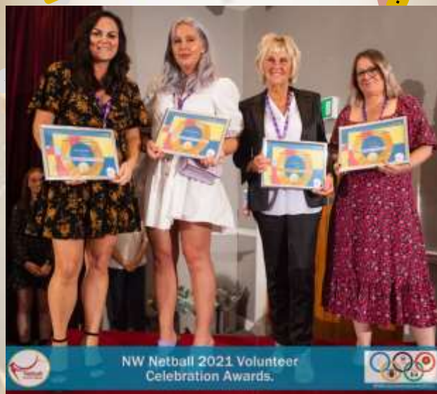
NW Netball 2021 Volunteer Celebration Awards.