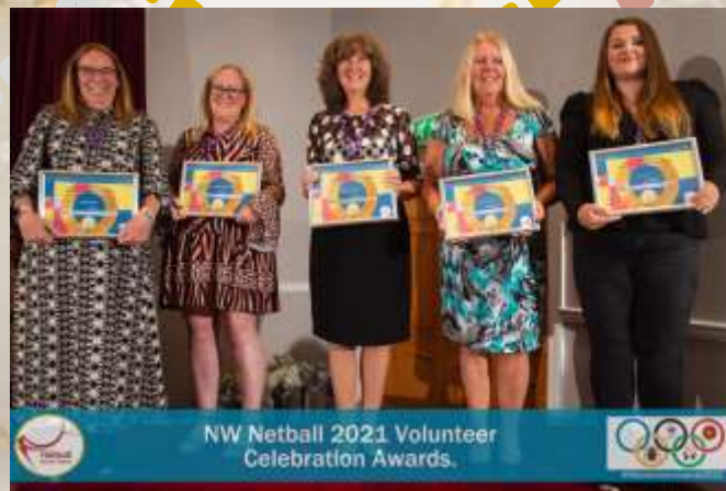
NW Netball 2021 Volunteer Celebration Awards.